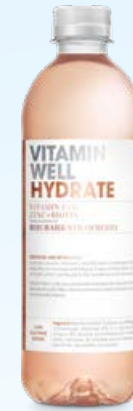
HYDRATE Rhubarb/ Strawberry