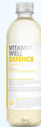
DEFENCE Citrus/ Elderflower