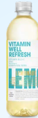
REFRESH Lemonade/ Kiwi